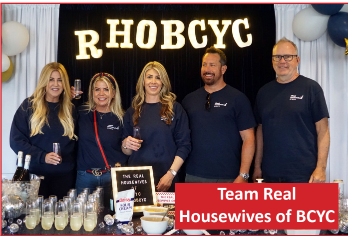
Team Real Housewives of BCYC