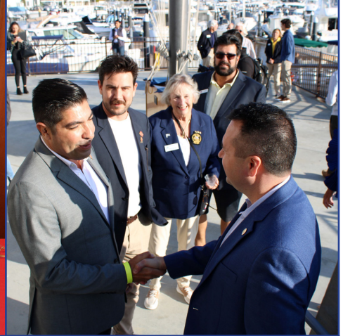
N2E Kick Off Party