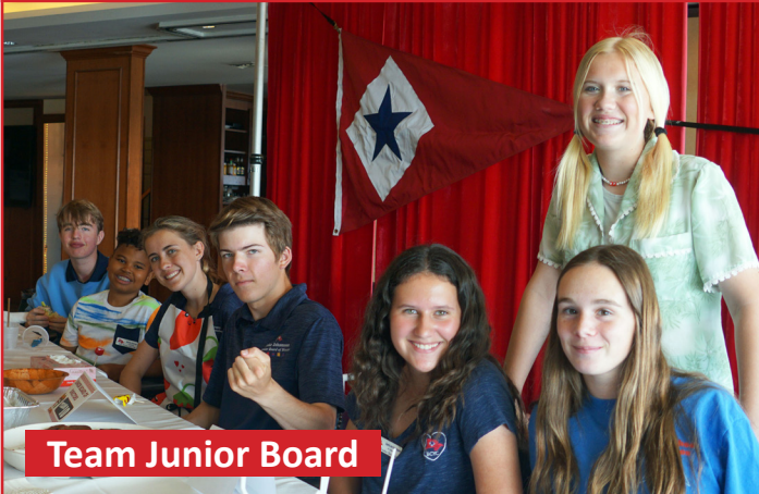
Team Junior Board