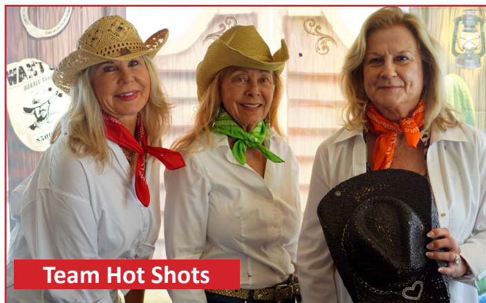
Team Hot Shots