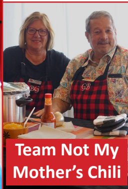
Team Not My Mother's Chili