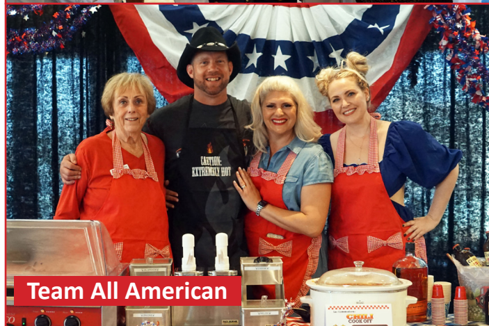
Team All American