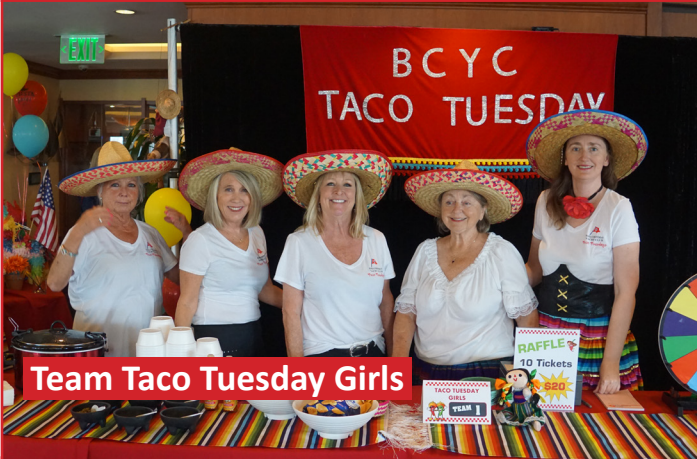
Team Taco Tuesday Girls