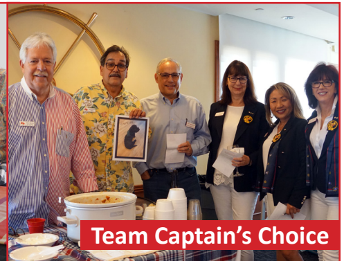
Team Captain's Choice