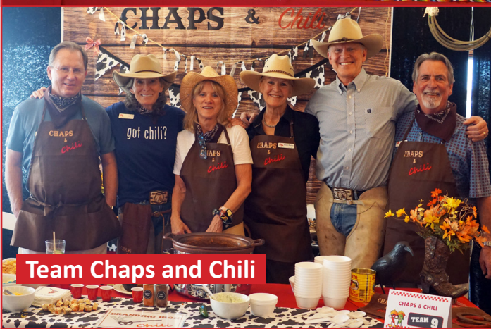
Team Chaps and Chili