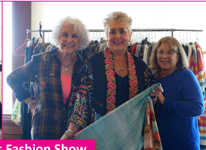
Las Commodoras Fashion Show