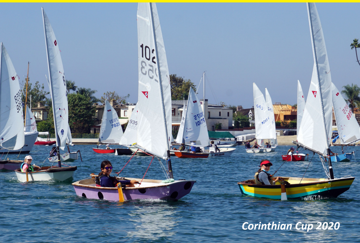
Corinthian Cup 2020