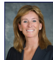
EB Barden Traditions