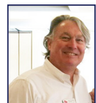
SC Ted O'Connor House and Grounds

Photos of Committee Chairs who attend Steering Committee Meetings