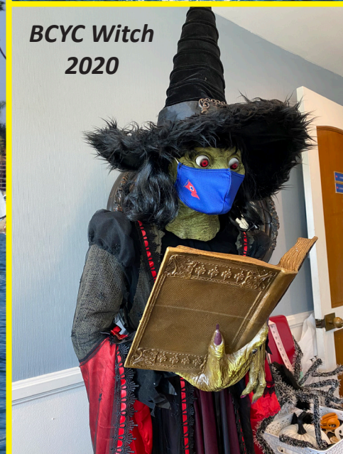
BCYC Witch 2020