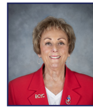
Barbara Eden Las Commodoras