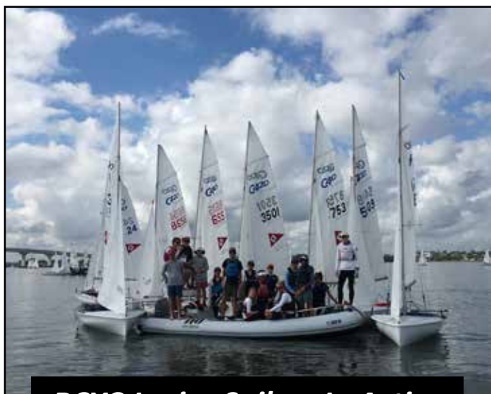
BCYC Junior Sailors In Action