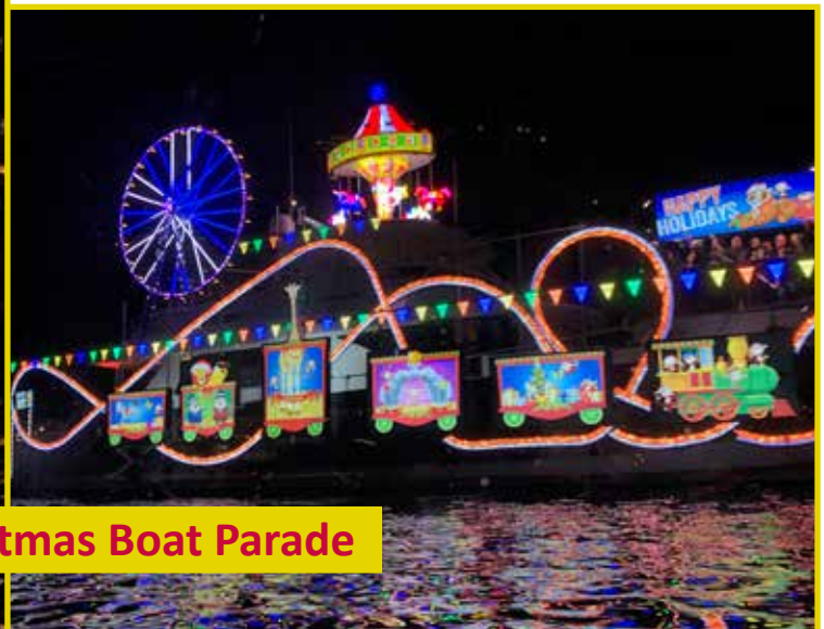
2019 Christmas Boat Parade