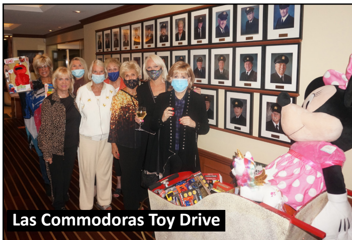
Las Commodoras Toy Drive