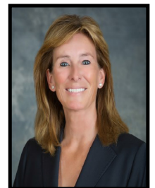
EB Barden Traditions