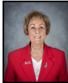
Barbara Eden Las Commodoras