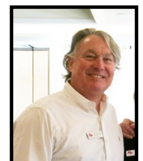
SC Ted O'Connor House and Grounds

Photos of Committee Chairs who will attend Steering Committee Meetings