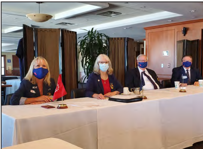
Staff Commodore Breakfast