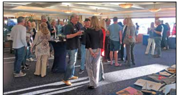
January Open House

Did you know that the gate code has changed for the marina and dry storage areas? Please contact the BCYC club office if you need the new code and notify any of your vendors who will be impacted by this change.