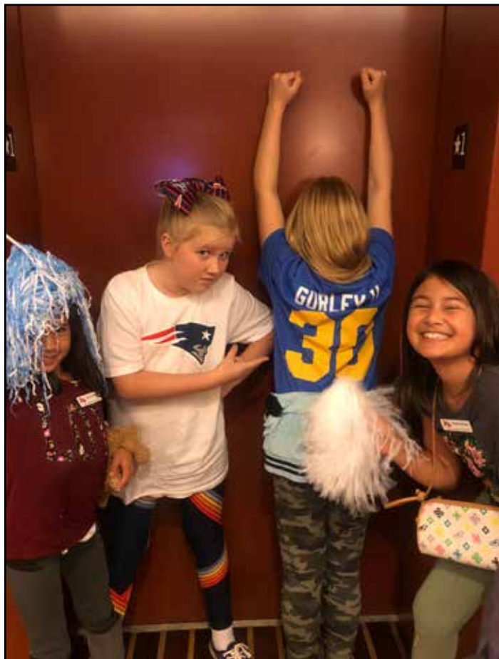
Super Bowl Kid's Zone Party

Our next event is ladies' Spa Day on Saturday, March 16, featuring a 45-minute yoga class, mini facials, shopping and mimosas. Relax with us, invite a friend and come meet fellow members.