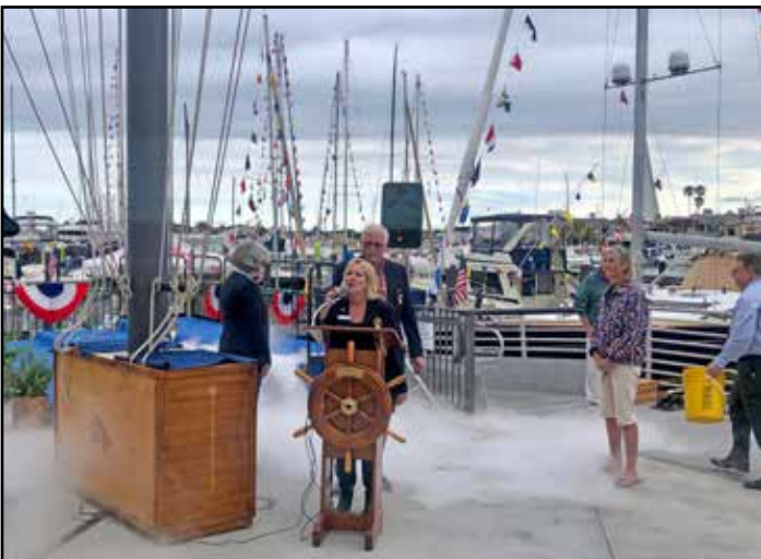
Closing Night 2019

By popular demand, pop-up Signature Dining is returning. See the Food and Beverage article in this issue of The Masthead for more details. Make a reservation and bring your friends and family to enjoy these special dining nights.