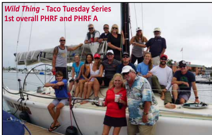
Wild Thing - Taco Tuesday Series 1st overall PHRF and PHRF A

Be sure to read the November issue of The Masthead to find out about the rest of our 2019 racing schedule.