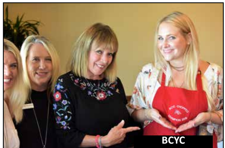
BCYC Chopped Champion 2018

There is something for everyone at BCYC. October offers as many varied events as the last two months. If you cannot find something of interest to you, look again! The Wild Sailing Regatta awards night and party, Scotch and Cigar Night, Oktoberfest, the Avalon Cruise, pumpkin carving and a costume party all happen in one month! Try something new this month at BCYC, as you have many wonderful choices.