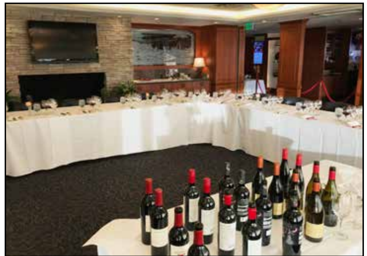
18 members and 8 cases of wine for Wine 101 event