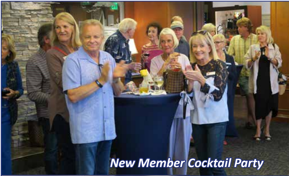
New Member Cocktail Party