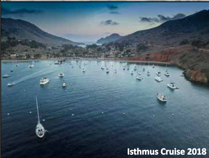
Isthmus Cruise 2018