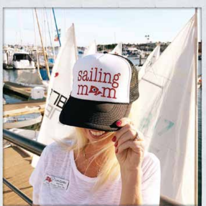
Get on board!!