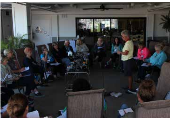
Women's Sailing Convention

Although the Newport to Ensenada race (starting April 27) is not a BCYC race, many racers from BCYC participate. If you haven't signed up yet, you still have time to find a crew, get your boat prepped and replace the batteries in your GPS. Hurry, don't miss the thrill of victory!