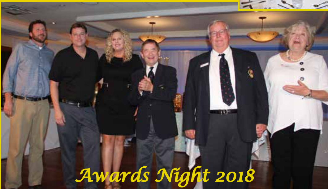
Awards Night 2018