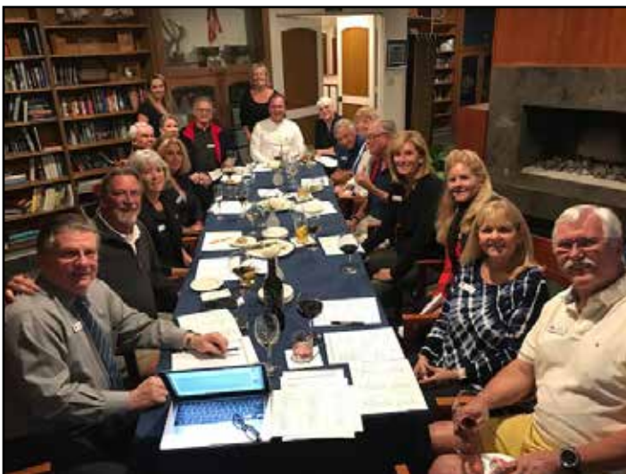
Food and Beverage Committee