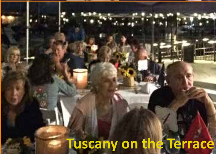
Tuscany on the Terrace