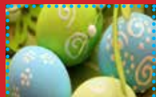
Easter Champagne Brunch Buffet

EASTER BRUNCH SUNDAY, APRIL 16 10 am - 1 pm Adults $38++, Kids $20++