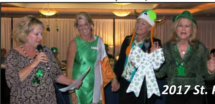
2017 St. Paddy's Day