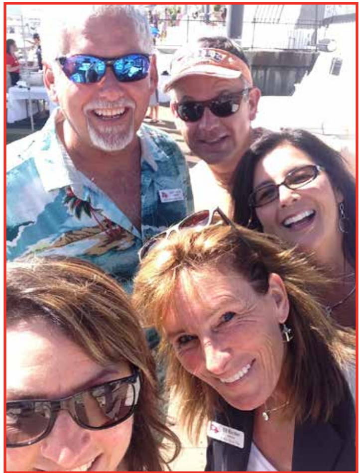
Happy Open House Attendees