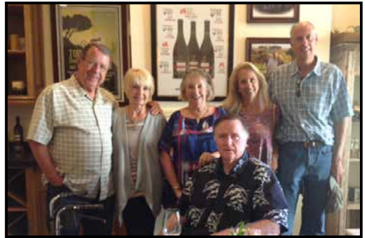
Visiting the Windsor Oaks Winery