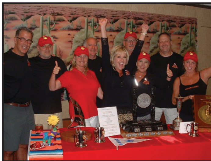
Wild Thing Crew