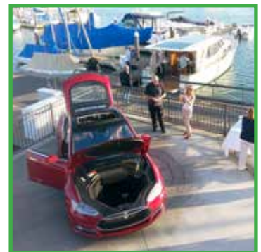
Tesla Greenline Event