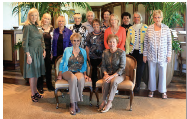
Las Commodoras Ladies