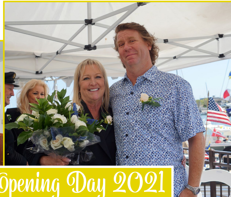
Opening Day 2021