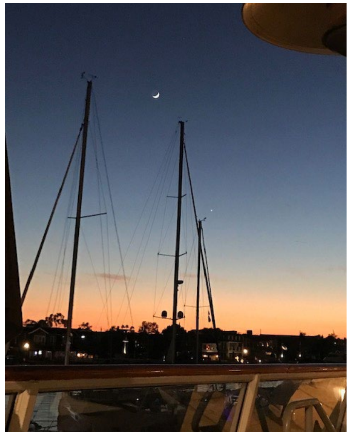
The Moon and Venus (Venus is the small spec near the sailboat mast)

We need a few members to assist in inventorying the extra burgees from other yacht clubs so that we can determine if there are duplicates or originals that need to be hung. Please contact me so I can coordinate this important job. The House Committee welcomes all members who have ideas to contribute to make our club even more enjoyable.