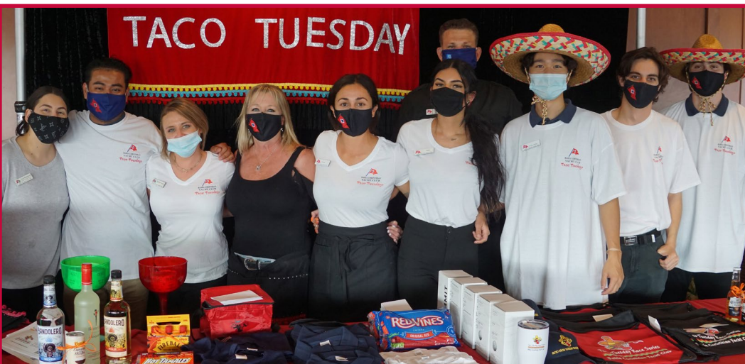
Fabulous BCYC Taco Tuesday Staff!